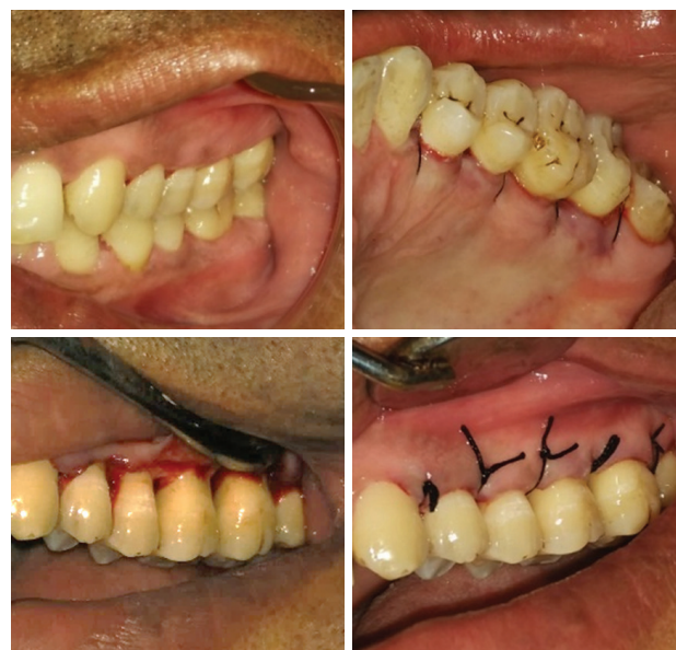
Figure 2: Open flap debridement-Surgical therapy.