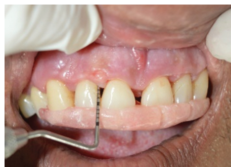
Figure 3: PPD and CAL recording with the stent and UNC-15 probe.

and 6 months were 6.23 mm, 5.29 mm and 4.36 mm, respectively and mean change from baseline to 3 months and baseline to 6 months were 0.94 mm and 1.87 mm, respectively. Similarly, in the OFD group, the mean PPD at baseline, 3 and 6 months were 6.22 mm, 5.14 mm and 4.17 mm, respectively and mean change from baseline to 3 months and baseline to 6 months were 1.07 mm and 2.04