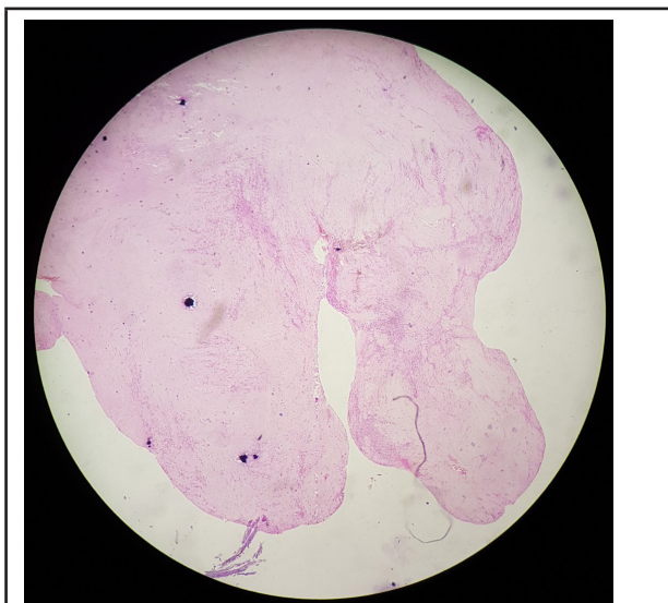
Figure 3. Histopathology of the extruded disc.

Postoperatively, the patient had relief from back pain and leg symptoms immediately after surgery. The patient was discharged and advised for physiotherapy. His stitches were removed two weeks after the surgery. There was complete recovery of the right lower limb's motor power and sensation during his three months follow up.