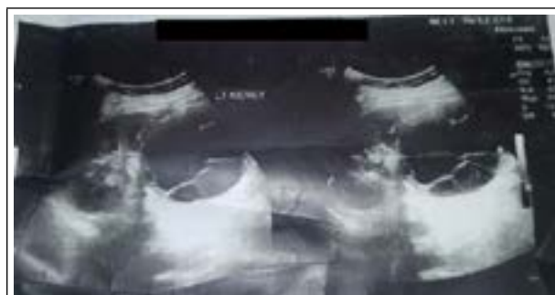
Figure 1. Ultrasound image showing left renal hydatid cyst with internal septations.

Ultrasonography revealed cystic lesion measuring 7.1cm × 7.9cm in lower pole cortex of left kidney with internal septations suggestive of hydatid cyst (Gharbi Type III) (Figure 1).