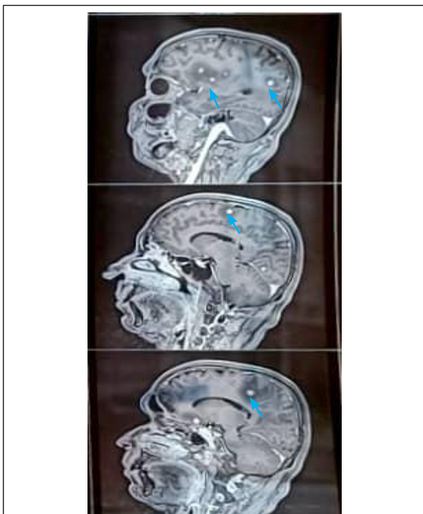
Figure 2. MRI brain (T1, sagittal view) showing multiple ring-enhancing lesions.

Considering the clinical and laboratory findings, neuroimaging findings and geographical location of the patient, a probable diagnosis of neurocysticercosis