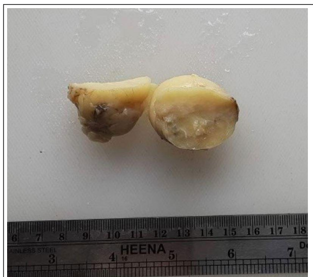
Figure 1. Well circumscribed encapsulated mass with yellowish cut surface and focal grayish-white areas.

Microscopically, the tumor was surrounded by a fibrous pseudo capsule and consisted of mature adipocytes admixed with areas of breast ducts and lobules which are surrounded by fibro collagenous tissue (Figure 2).