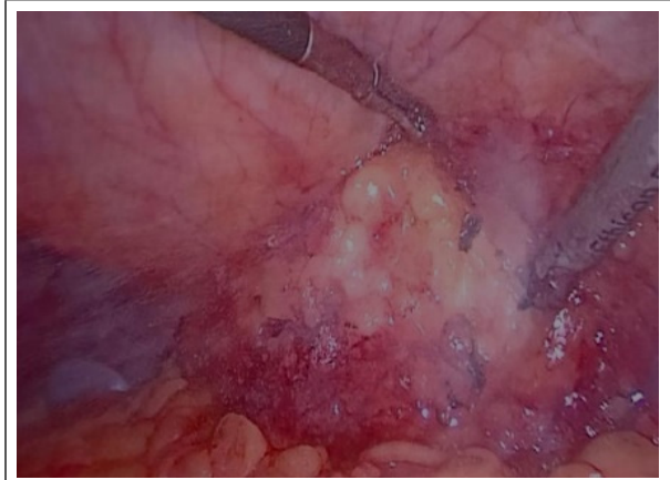
Figure 4. Intraoperative picture showing herniation of the paranephric fat.

The defect was visualized by dissecting omental adhesions and entering the retroperitoneal space by incising the peritoneum over the defect. The location of the defect was also guided by external palpation of the hernia. A left superior lumbar hernia with herniation of perinephric fat was noted intraoperatively (Figure 4).