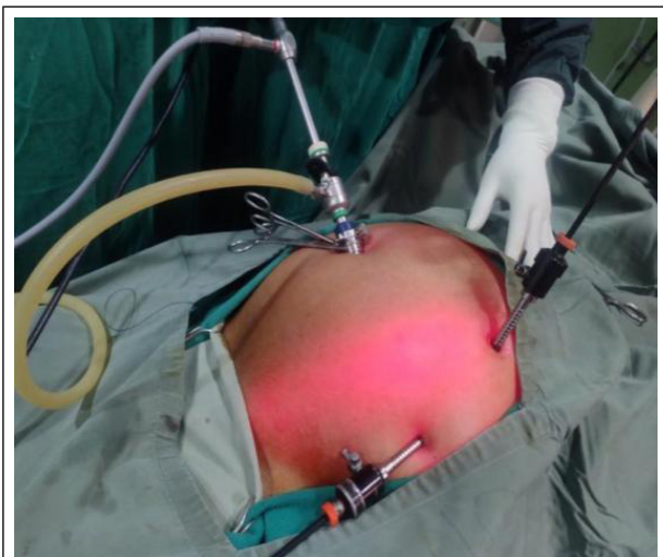
Figure 3. Port placement during laparoscopic approach.

Laparoscopic transperitoneal mesh repair was planned. The patient was kept supine, and pneumoperitoneum was created using Hassan's open technique via a 10mm umbilical port. Two additional ports were created under direct vision in the left hypochondrium and the left iliac region (Figure 3).