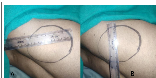
Figure 1. Lumbar hernia lateral view approximately; A) 13cm horizontally, B) 10cm vertically.

were unremarkable. On local examination, a 10x13cm swelling (Figure 1 A, B) was present in the left lumbar region just below the left 12 th rib. It was globular in shape, non-tender, non-mobile, irreducible with a well-defined border and smooth surface. The overlying skin was normal, and a visible cough impulse was present. The swelling was not ballotable and was non-pulsatile.